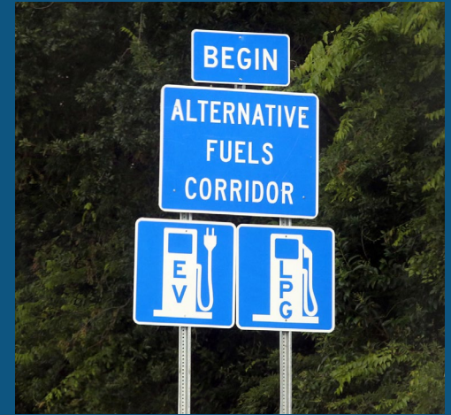
I-26 (South Carolina)