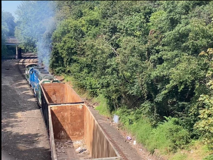
9-15-23 New York & Atlantic Railway locomotive, Queens, NYC