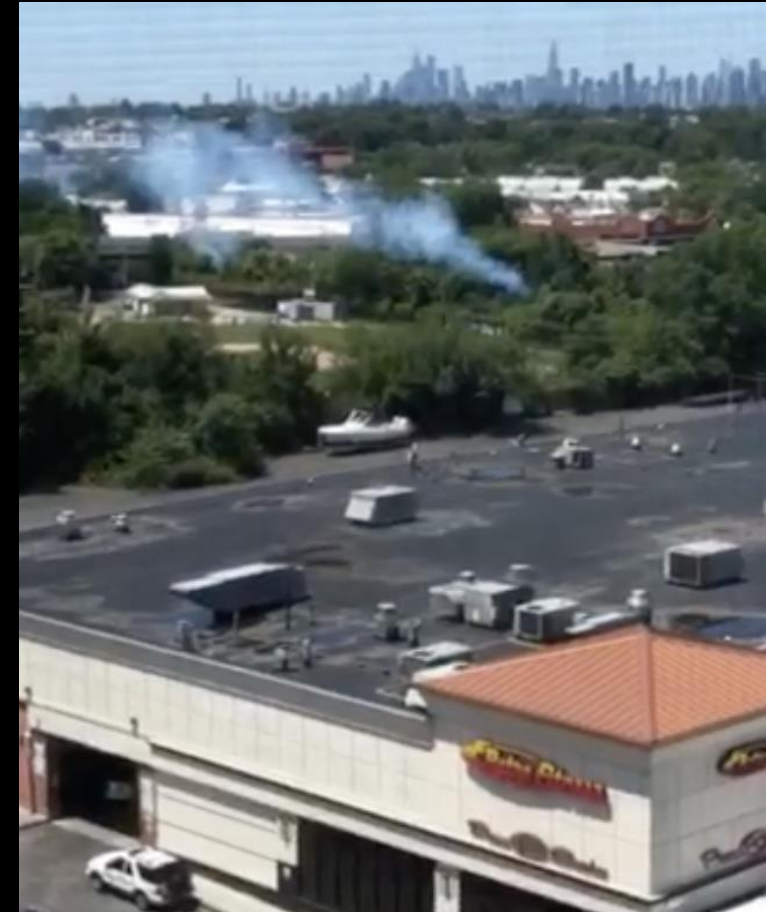
7-10-22 LIRR work train, Queens, NYC