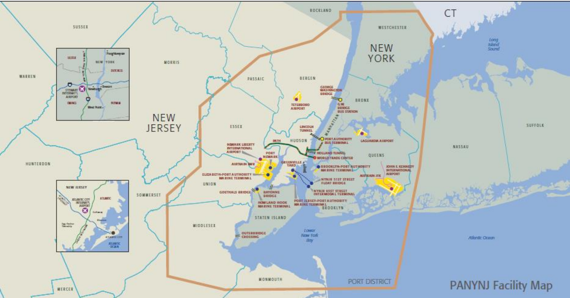
PANYNJ Facility Map