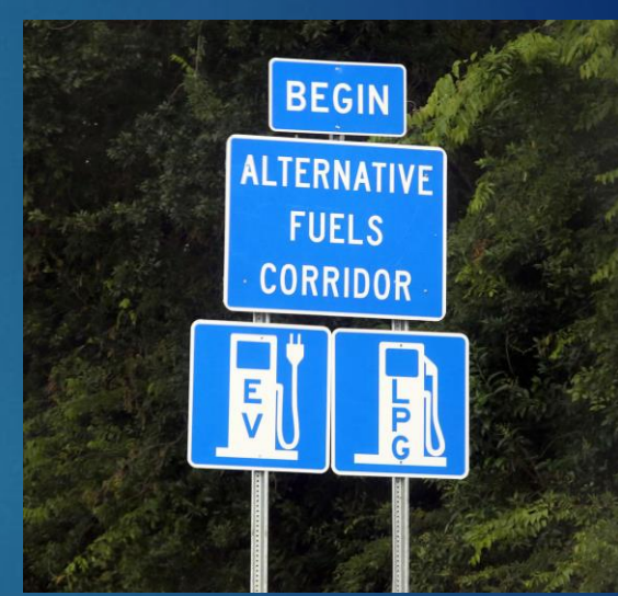
I-26 (South Carolina)